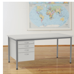
Suitable for our 1000 and 2000 table series