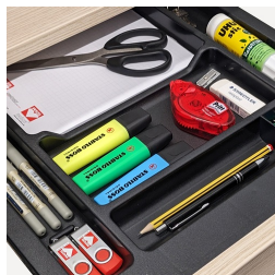
utensil drawer for office supplies