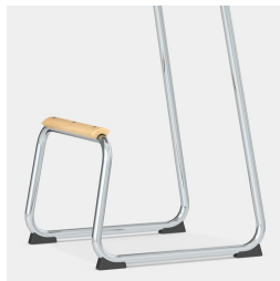
Robust sled frame