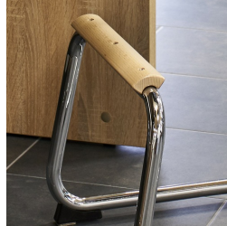
Footrest natural lacquered