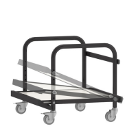
different inclinations adjustable