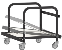
different inclinations adjustable