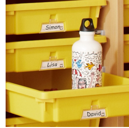
robust Tidy Boxes