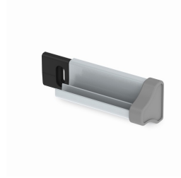
Invisible rail fastening compensates for wall unevenness