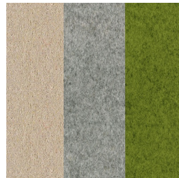
Available in 3 different colors