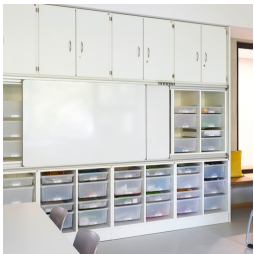
Can be mounted on cabinet wall