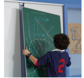
Removable board elements