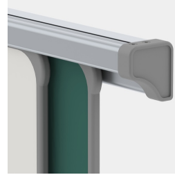
Plastic caps prevent accidental ejection