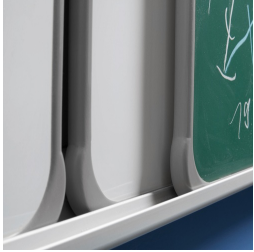
Board elements with ASSODUR® edge can be moved one behind the other