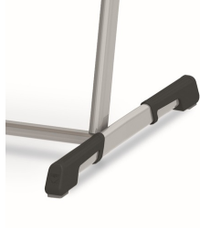
Floor protectors with integrated step protection