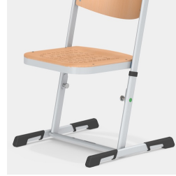
Stable, height-adjustable sled frame